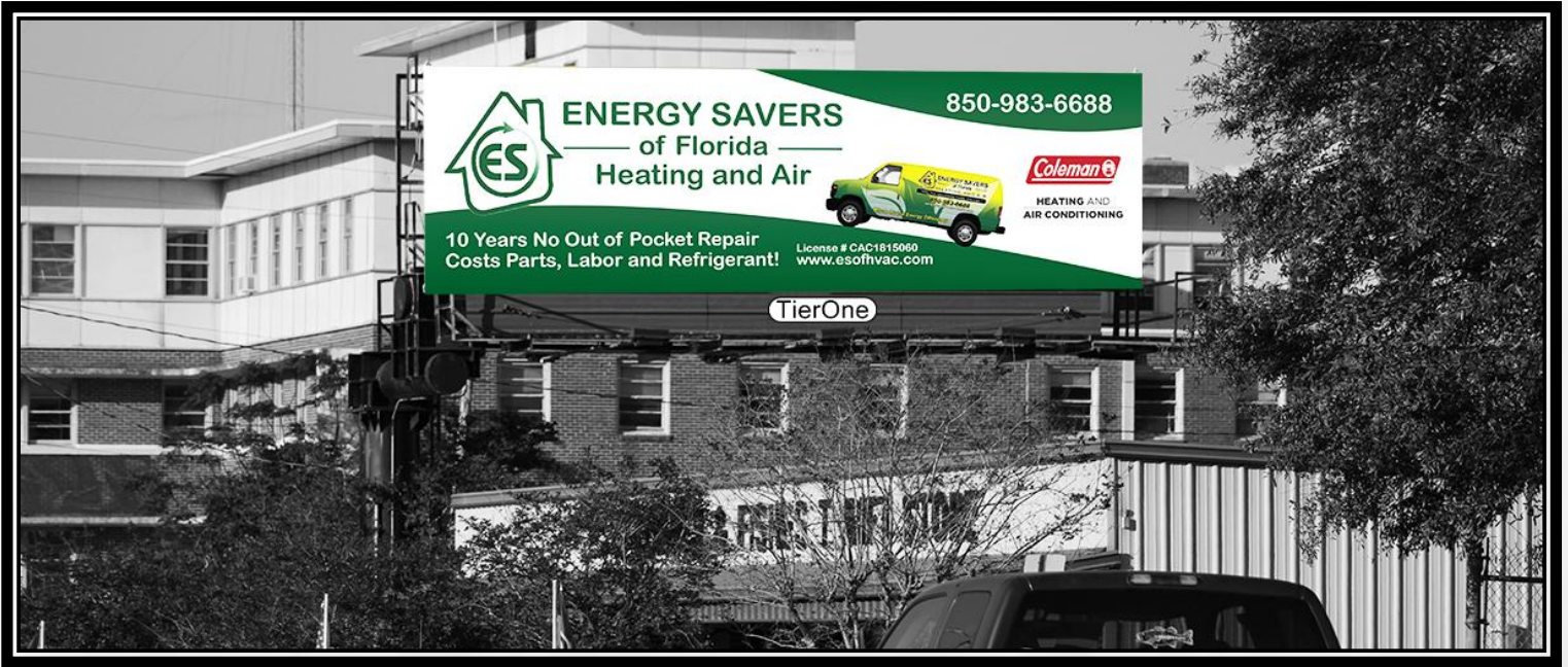
North Palafox @ Cervantes Facing South for Northbound Traffic