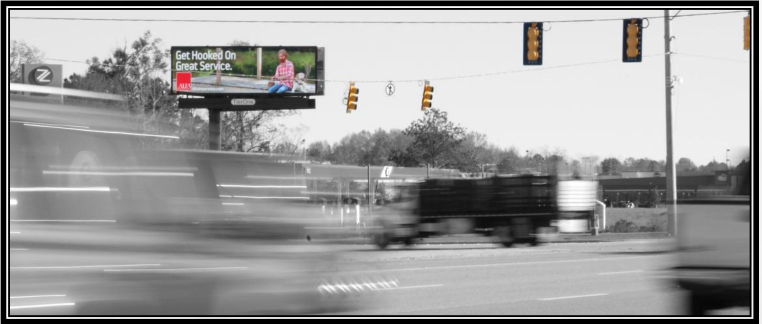
Chantilly Parkway at Eastchase Parkway Facing North for Southbound Traffic