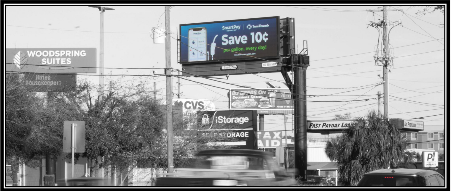
Racetrack Road @ Eglin Pkwy Facing West for Eastbound Traffic