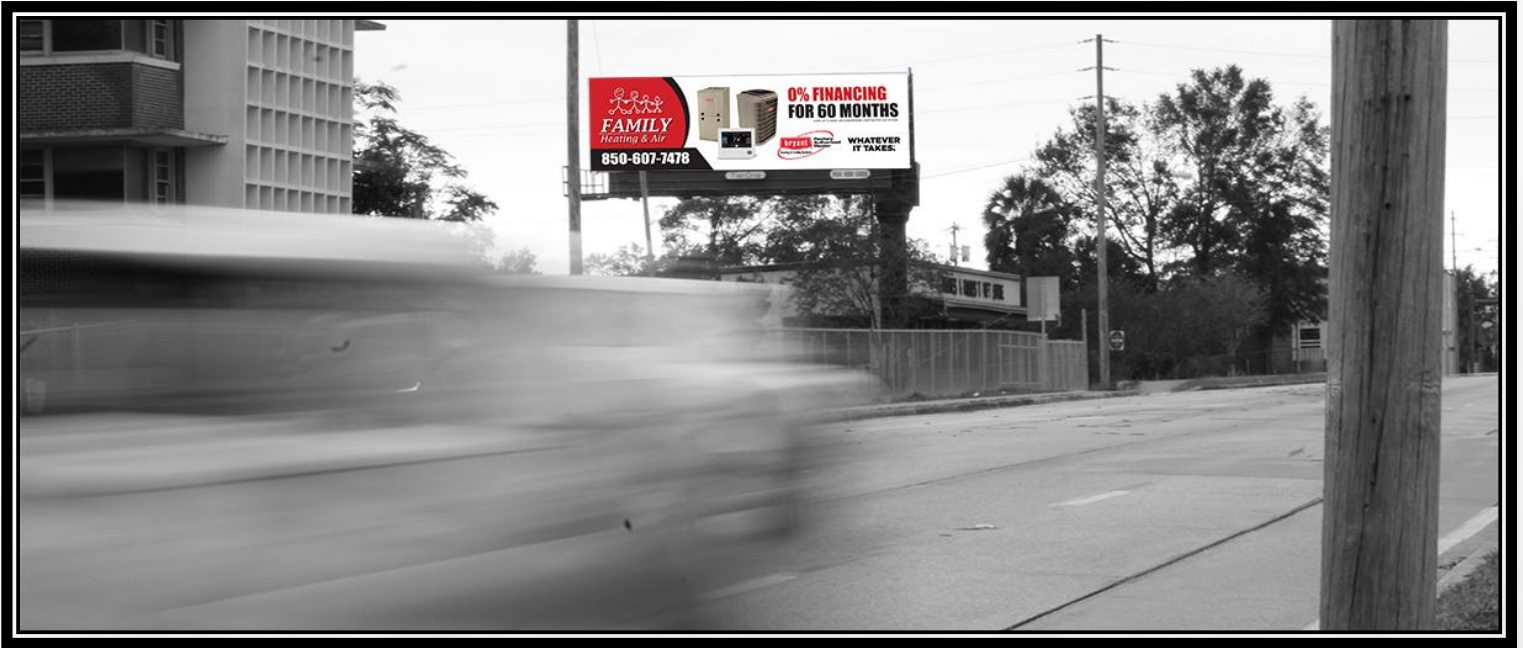
North Palafox @ Cervantes Facing Northeast for Southbound Traffic