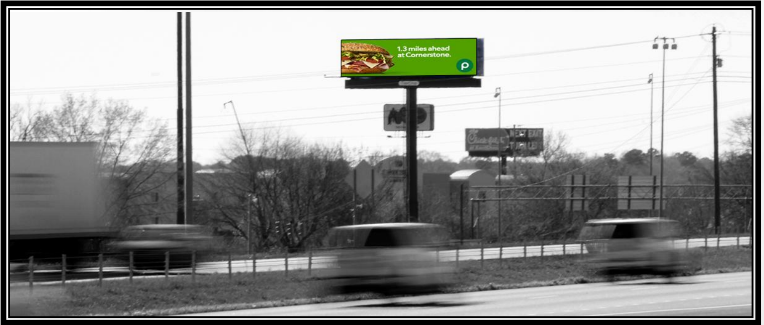
I-85 Inbound, Chantilly Parkway Facing East for Westbound Traffic