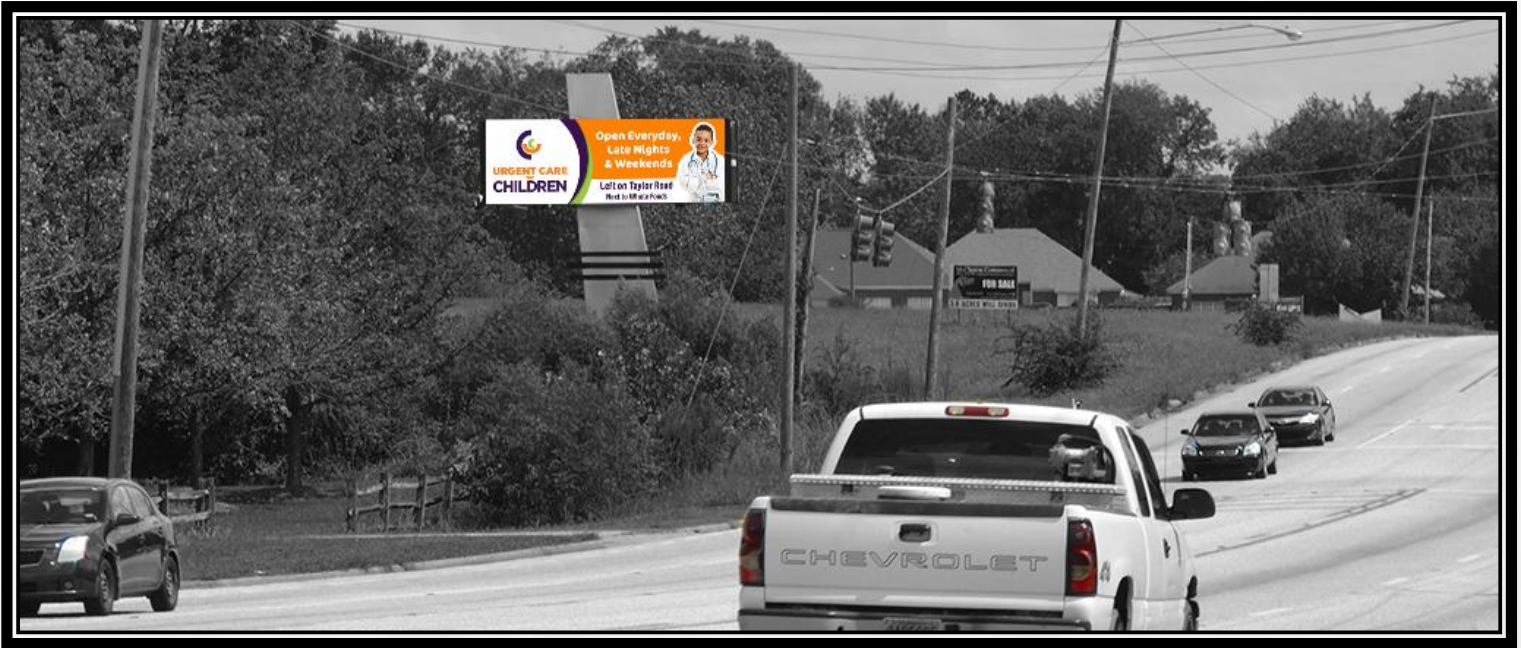
Vaughn Rd at Festival Drive Facing West for Eastbound Traffic

Elaborate structure helps this face stand out as a landmark. It is unusually close to the road and reads to people headed to Taylor Road, Bell Road as well as upscale Brighton Estates, Bellwood Estates, & Halcyon Park. On Sundays, travelers here are headed to one of the many churches in the area.