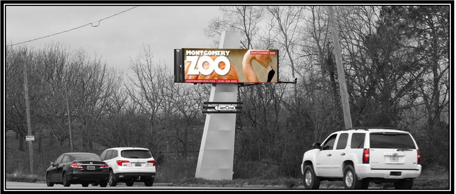
Vaughn Rd at Festival Drive Facing East for Westbound Traffic