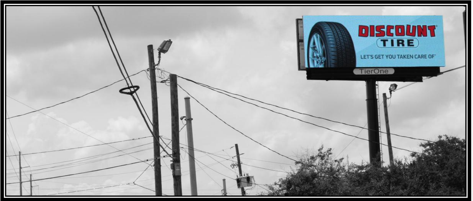
Carter Hill Rd at Narrow Lane Facing East for Westbound Traffic