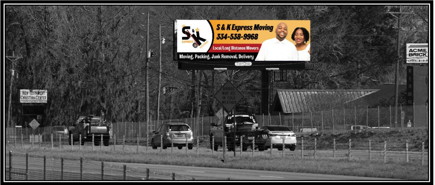
I-85 Outbound, Chantilly Parkway Facing West for Eastbound Traffic