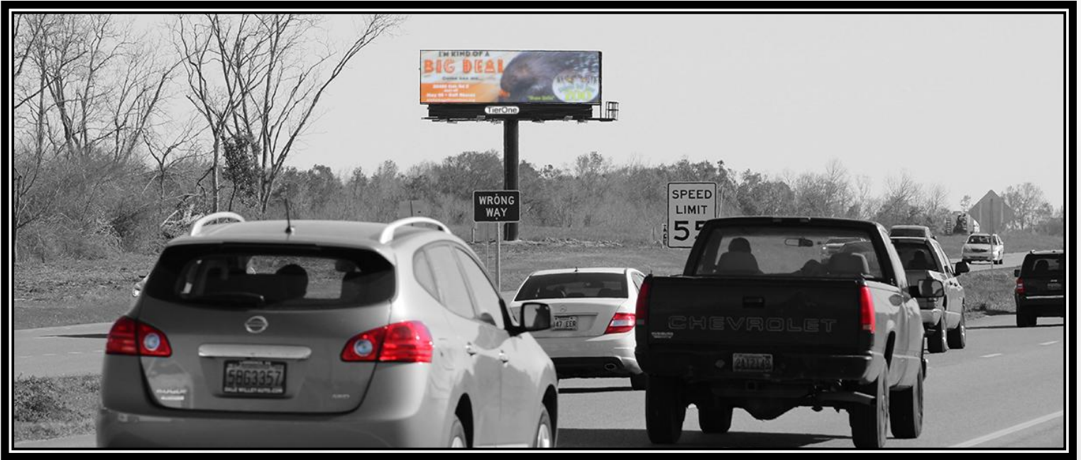
Baldwin Beach Expressway/CO RD 32 Cross read for Southbound traffic