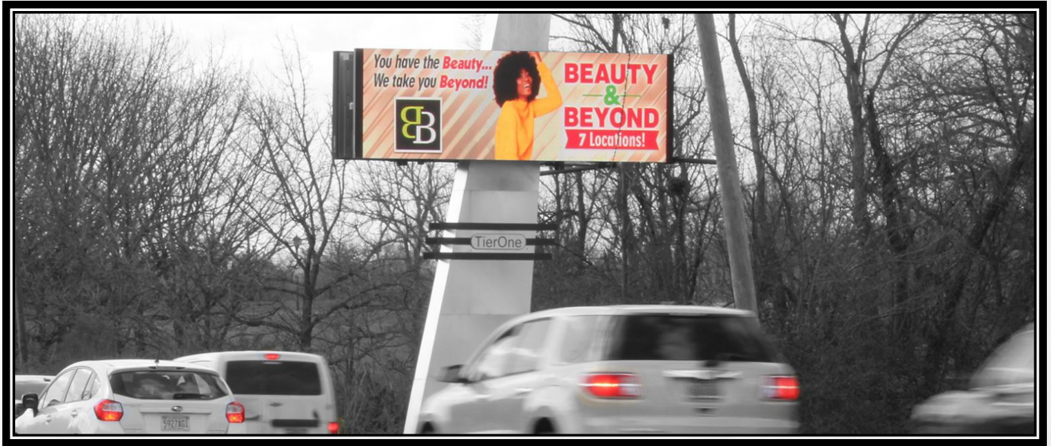
Vaughn Rd at Festival Drive Facing East for Westbound Traffic