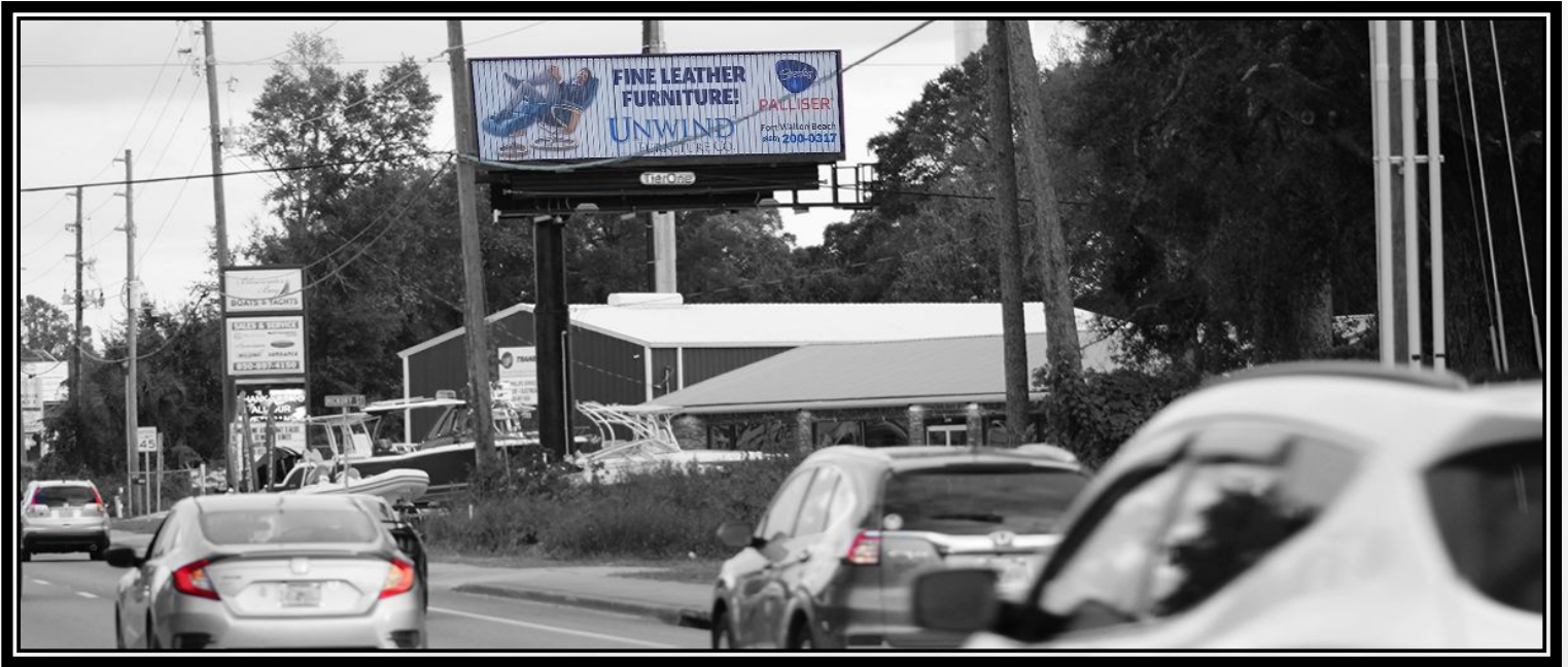
Hwy 20E Facing Northwest for Southeast Bound Traffic