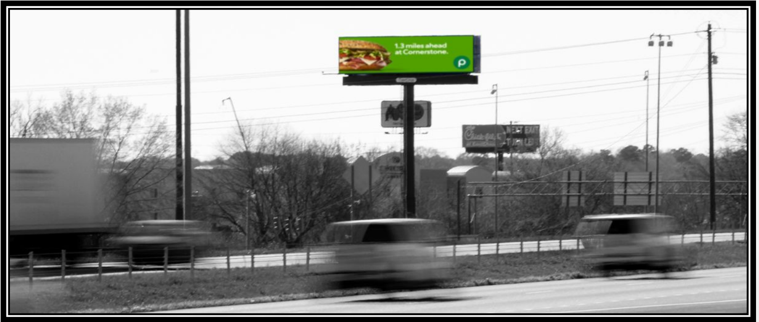
I-85 Inbound, Chantilly Parkway Facing East for Westbound Traffic