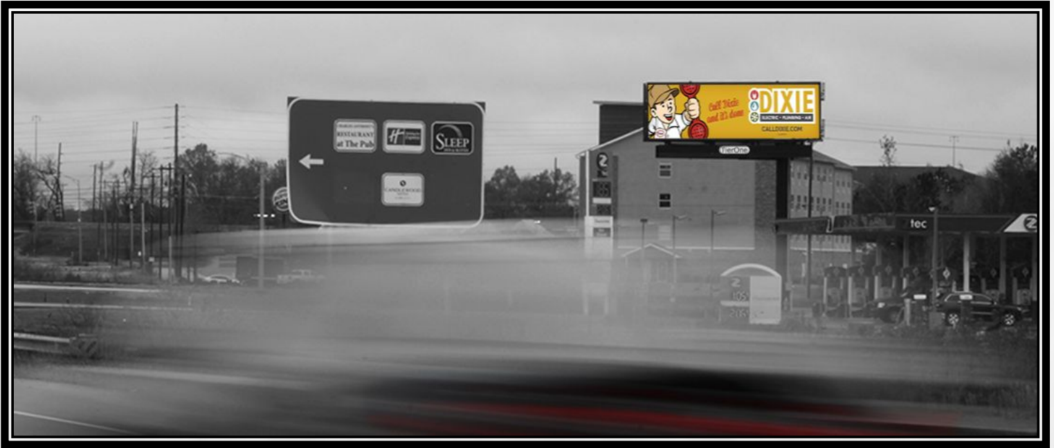
Chantilly Parkway at Eastchase Parkway Facing South for Northbound Traffic