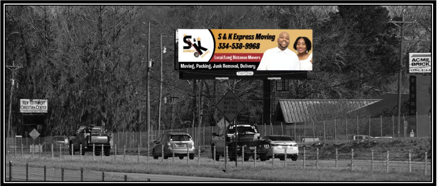
I-85 Outbound, Chantilly Parkway Facing West for Eastbound Traffic