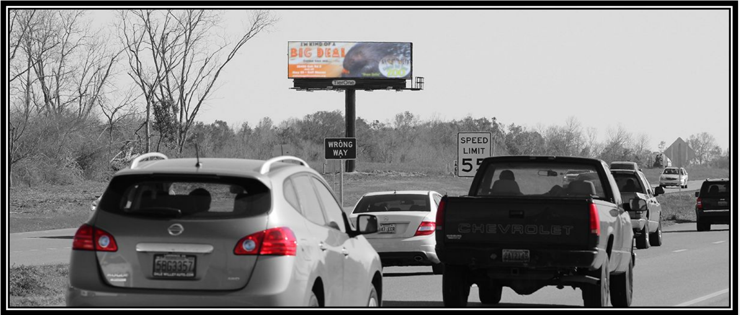
Baldwin Beach Expressway/CO RD 32 Cross read for Southbound traffic