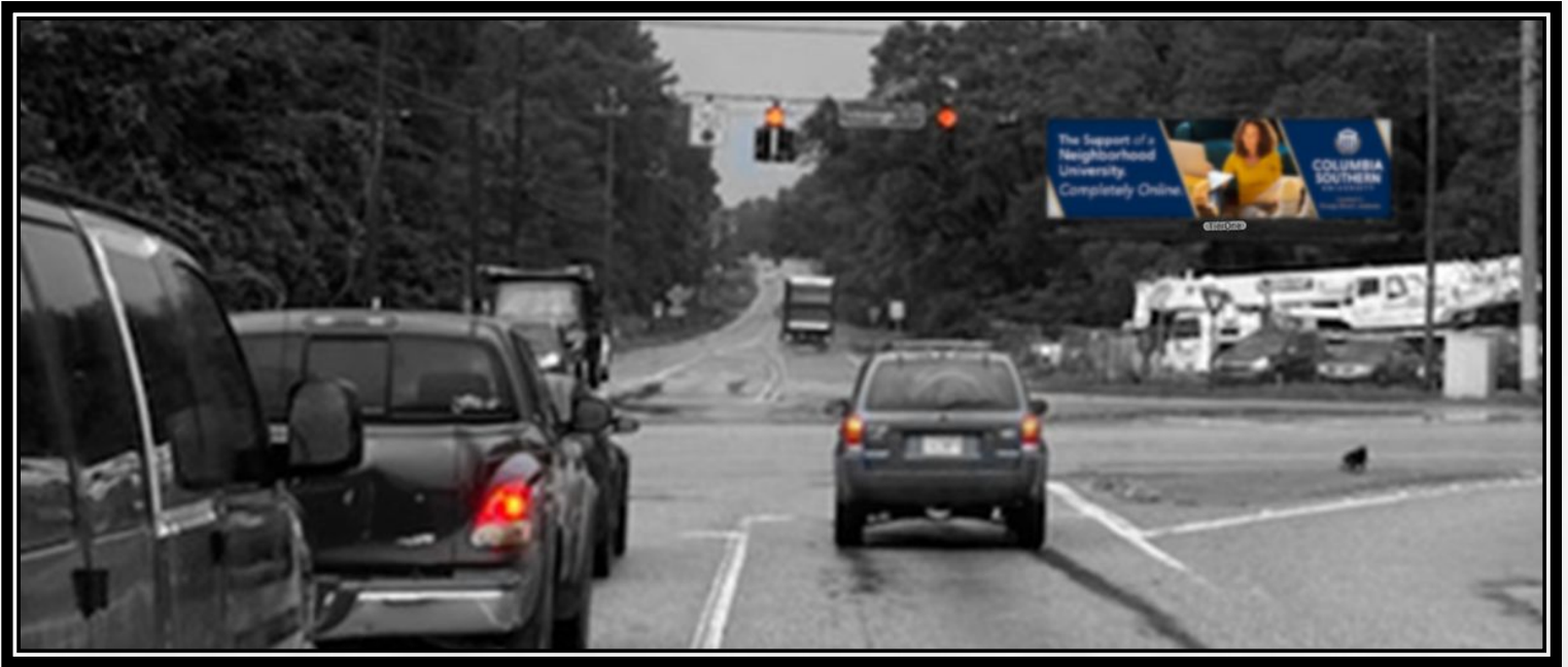
Howells Ferry at the Corner of Schillinger Right Read for East Traffic