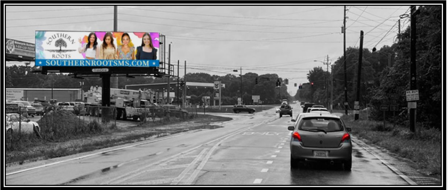
Howells Ferry at the Corner of Schillinger Cross Read for West Traffic