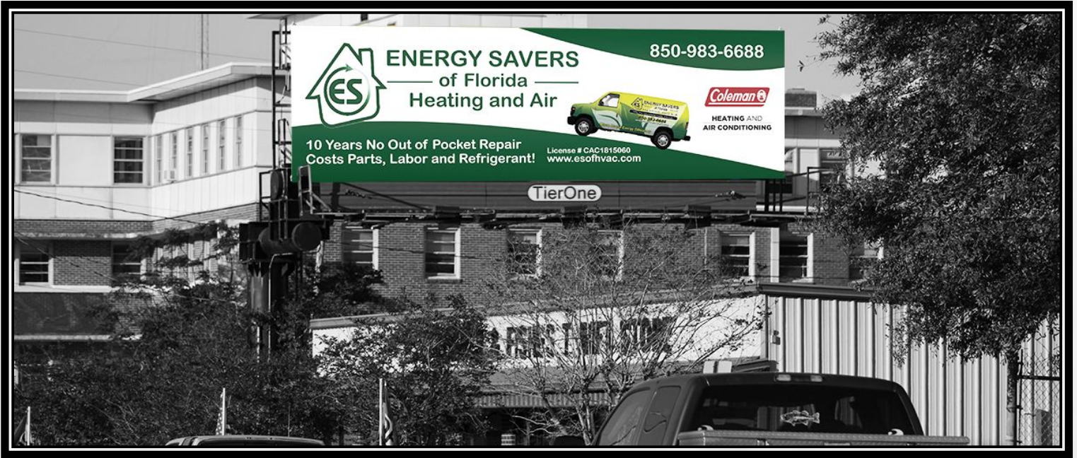
North Palafox @ Cervantes Facing South for Northbound Traffic