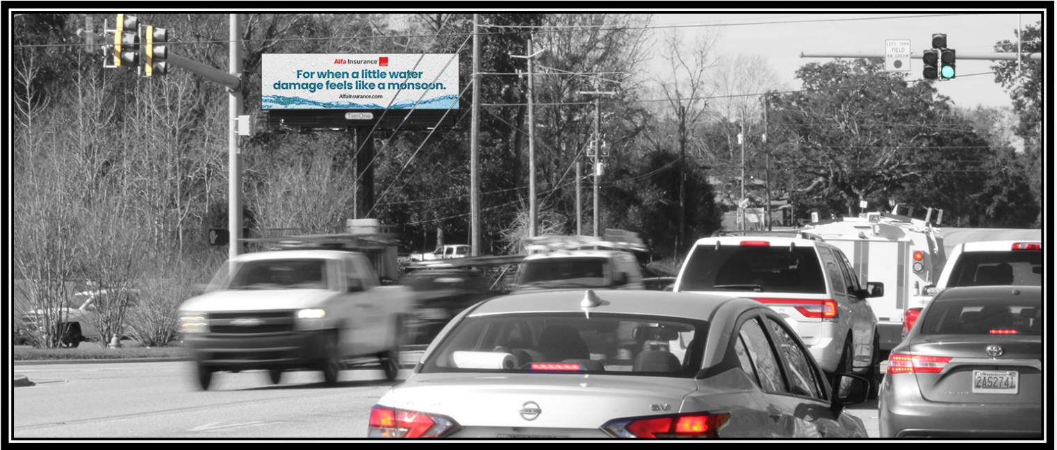
Old Shell Rd @ Cody Rd Cross read facing Westbound Traffic