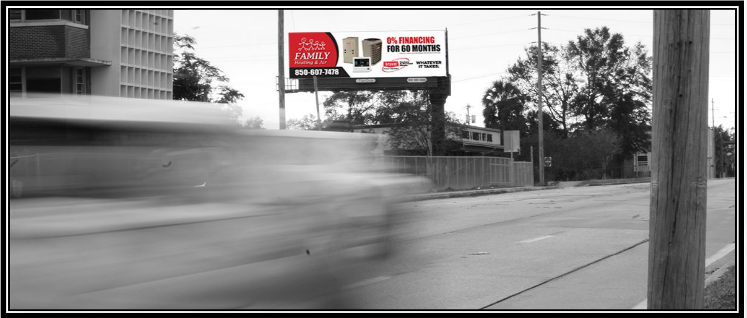
North Palafox @ Cervantes Facing Northeast for Southbound Traffic