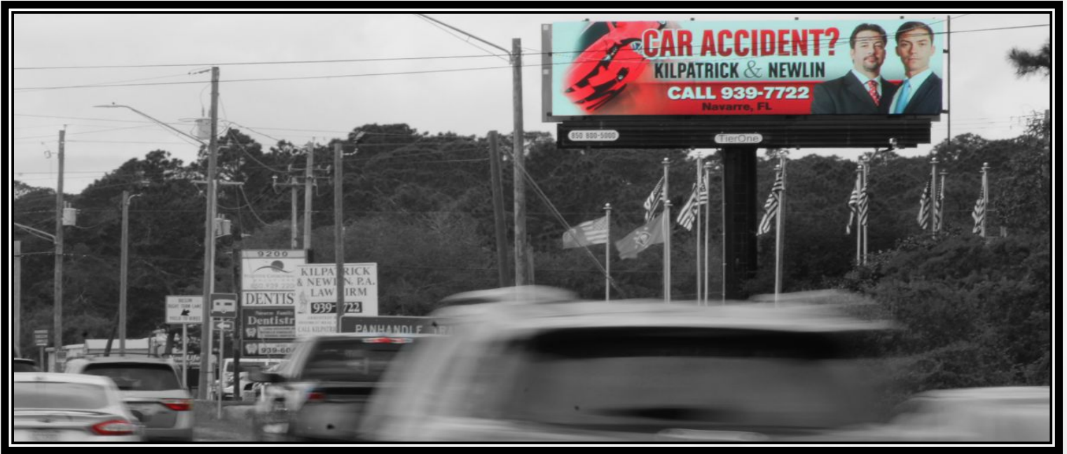
Hwy 98 @ Panhandle Trail Dr Facing East for Westbound Traffic