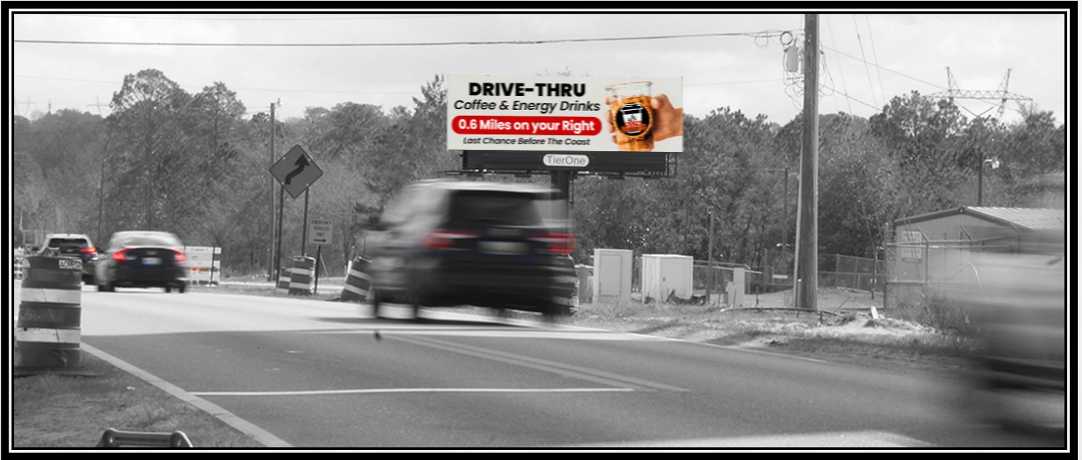
PJ Adams Parkway, Crestview Right Read for East Bound Traffic