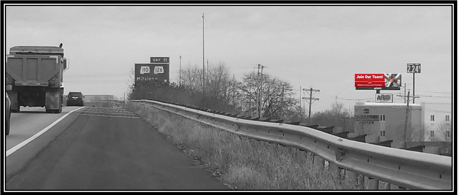
I-85 at Exit 11, Chantilly Parkway Facing West for Eastbound Traffic