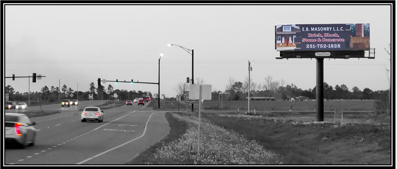
Baldwin Beach Expressway/CO RD 32 Right read for Northbound Traffic